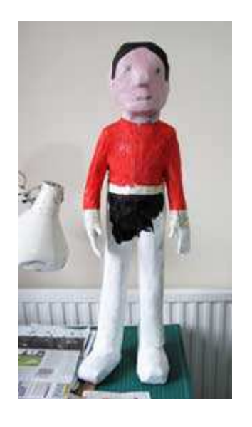
Basic colours were applied to the figure.