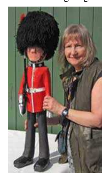
The extra length of jacket and final details were applied to make a smart Coldstream Guard.

A shell for the bearskin was cut to fit the head, from a shape made by covering a balloon with several layers of glued paper. This was painted black and tufts of wool were glued on with a hot glue gun.