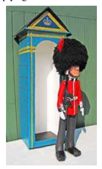
The finished sentry box completes the project.

A cardboard roof was made for the sentry box. An arch was cut in the front; the figure and the sentry box were painted white before applying colours.